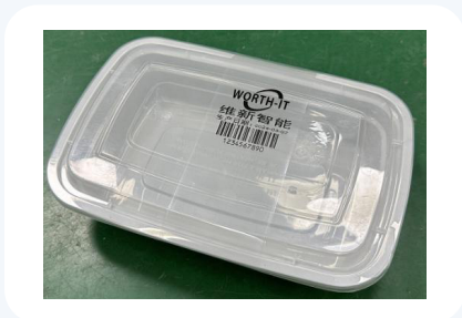
Tray & Container

A flexible solution for product bundling, promotional packaging and variable data coding.